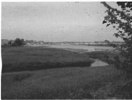
Portland waterfront from across Mill Cove

We haven't heard very much about it, but the South Portland walk combines great scenery, current activity and more than 200 years of history. Shortly after leaving the Hannaford Market start point you look to the left for a great view of the Knightville and Portland waterfronts across Mill Cove. Walk to Bug Light Park, look in one direction and you might see a luxury cruise ship just across Casco Bay docked at Commercial Street in Portland. In another direction, close at hand you will often find a giant tanker unloading. And all the while you are standing on the site of a shipyard that produced Liberty Ships during World War II. Further along the walk you can wander among the cannon emplacements and other features of Fort Preble, built in the early 1800s to deter the British; look across the water beyond the historic Spring Point light House to Fort Gorgeous, circa 1860s, which seems to occupy an entire island. And it's easy to discover while you are there that you are on the edge of the Southern Maine Community College campus..