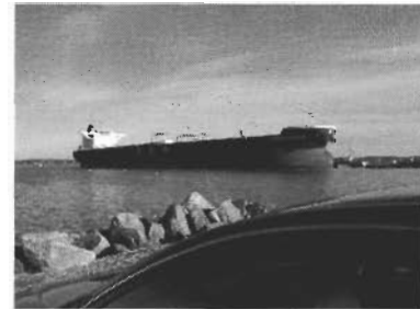
Giant tanker offloads adjacent to Bug Light Park