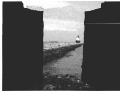
Spring Point Lighthouse is to the right of barely discernable Fort Gorgeous seen through Ft. Preble cannon emplacement